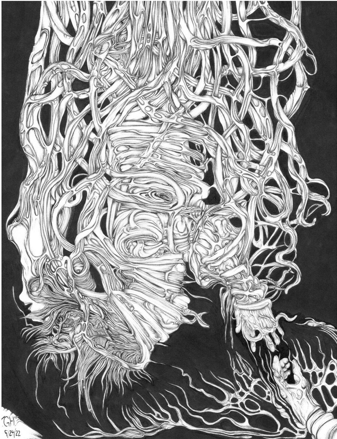
Featuring art from Thomas, amazing freehand