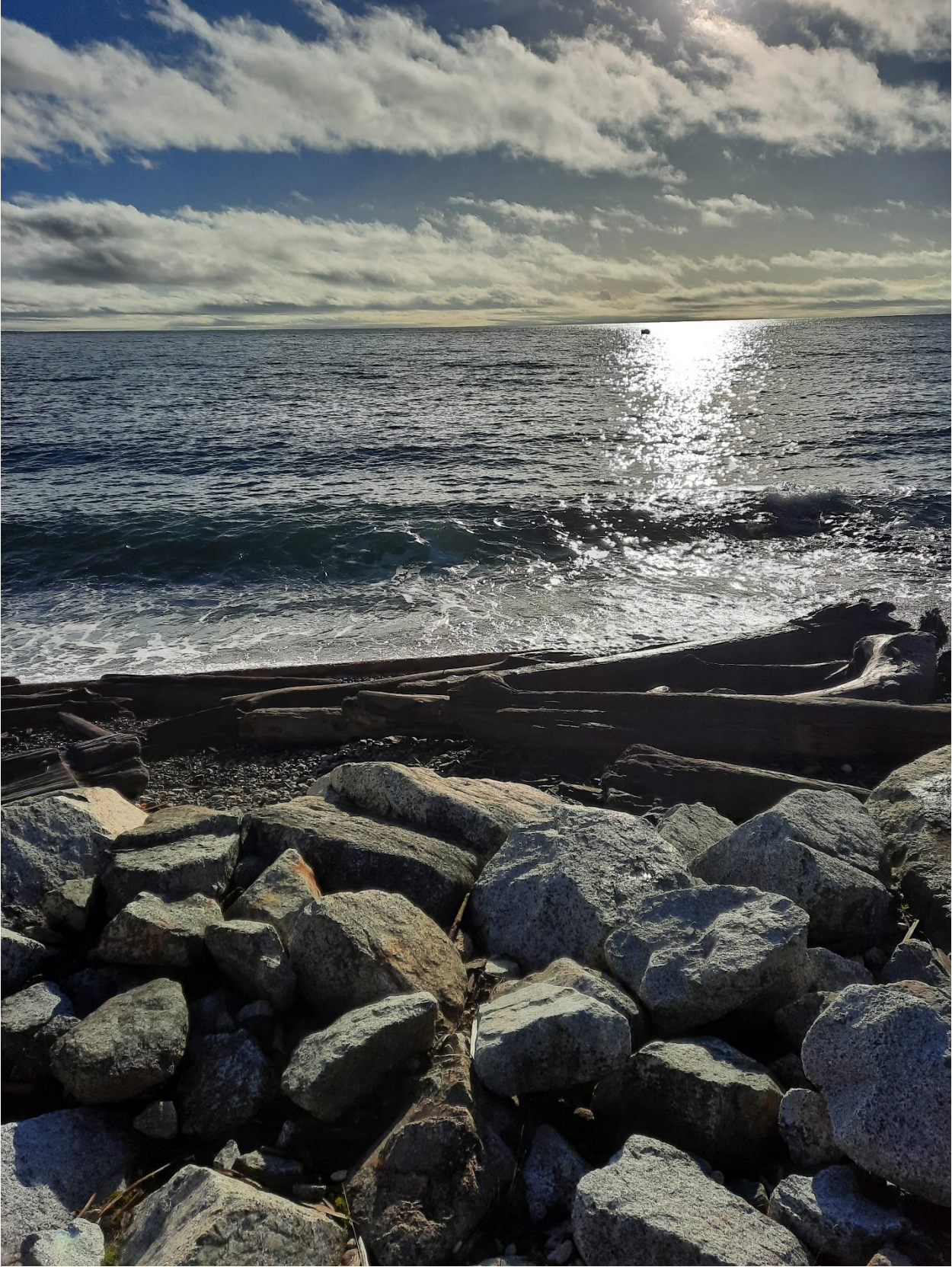
A beautiful late fall pic from Matt